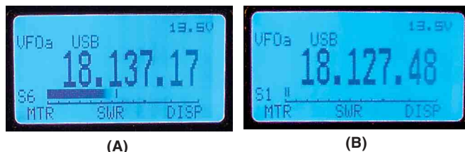
Figure 2—My transceiver display before applying the ICE 475-3 (A) and after (B). Notice that the S-meter display has dropped from S6 to S1.